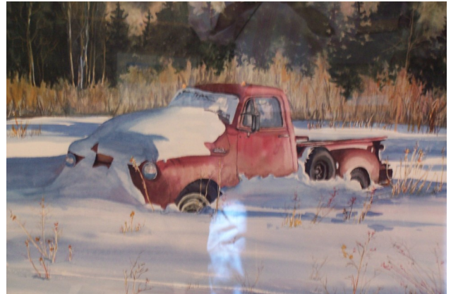
Best of Show "Papa's Truck" by Becky Silver