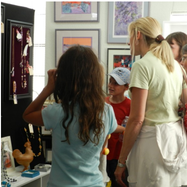
Reception at Art Gallery 3698