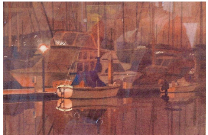
"Midnight at the Marina"

As part of the Westminster Centennial Celebration, we would like to honor couples who have lived in Westminster 40 years or longer. We are looking for stories and photos. Reception: 1-5 p.m. June 11...Please call 303-4226-4114 or 202-466-2512 if you qualify or know someone who does.