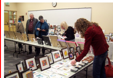
Art From the Heart Mini Show Visitors