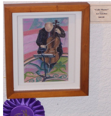
"Cello Master" by Art Sanchez Best of show Art Gallery 3698 Mini Show

A mini show will be held on February 9 thru 13th in conjunction with the special exhibit at the Library. There will be bin work, small framed paintings